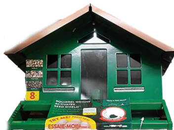
Squirrel proof feeders

Birds that winter in Southern Ontario are finding it more and more difficult to forage for seeds as urban sprawl has depleted much of their food sources. The use of pesticides in our lawns, while reduced over the past decade, has also affected our wild bird populations.