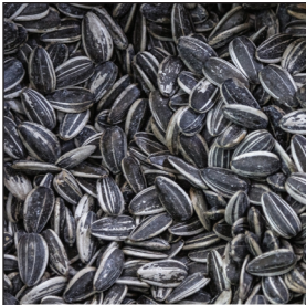
Striped Sunflower Seeds