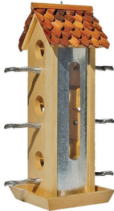
Tin Jay Feeder